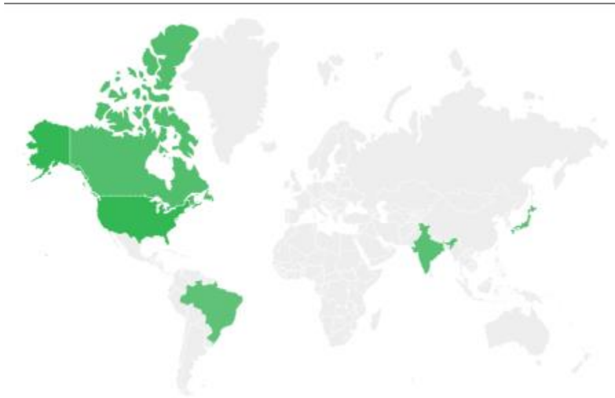
Alexa visualization of traffic to The Pirate Bay

disabled in countries where such a regime is in place. As a result, visitors to the site come disproportionately from Canada and the United States. The figure below depicts the geographic distribution of traffic to The Pirate Bay: